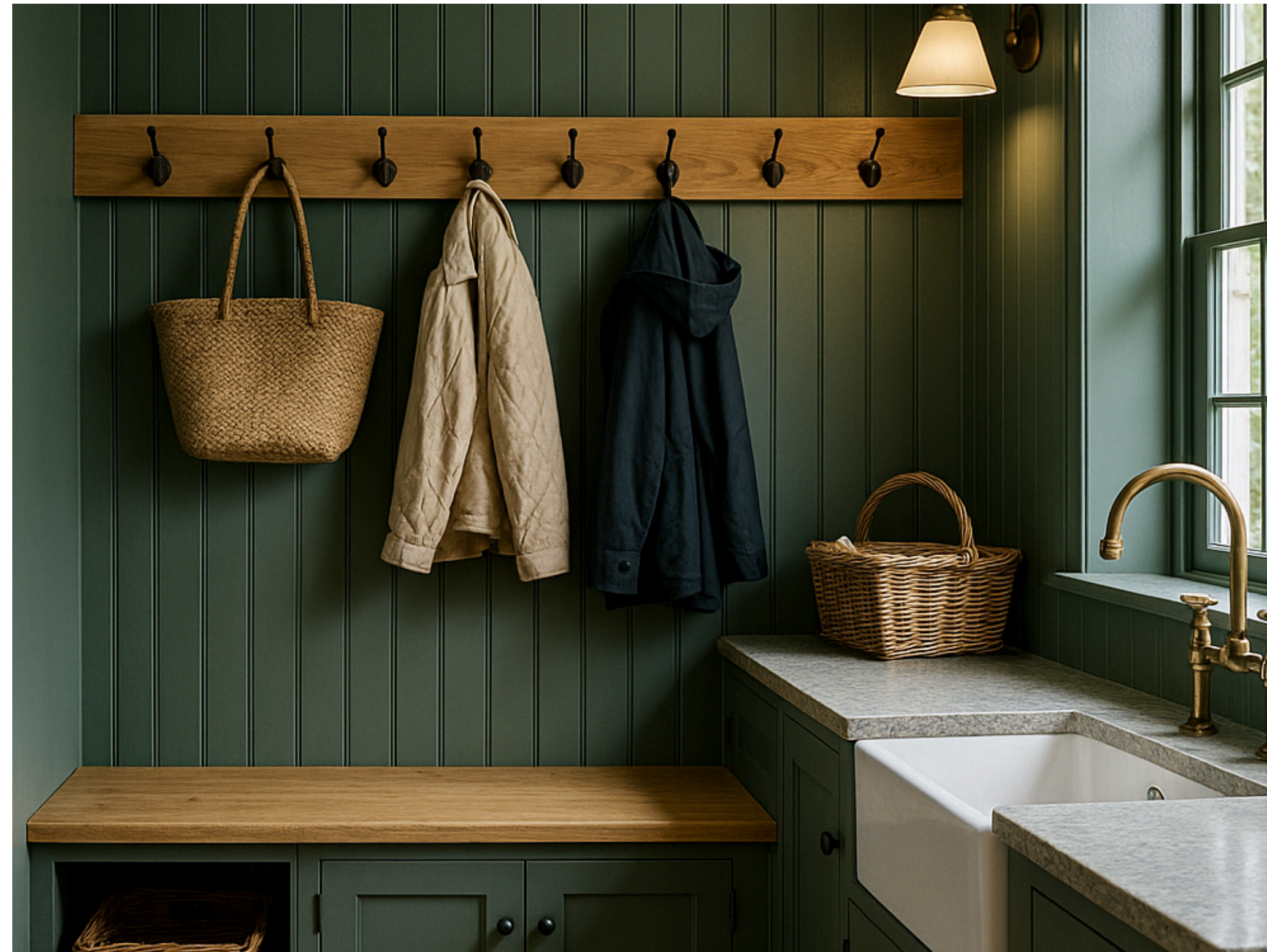
Deep green boot room with handcrafted storage