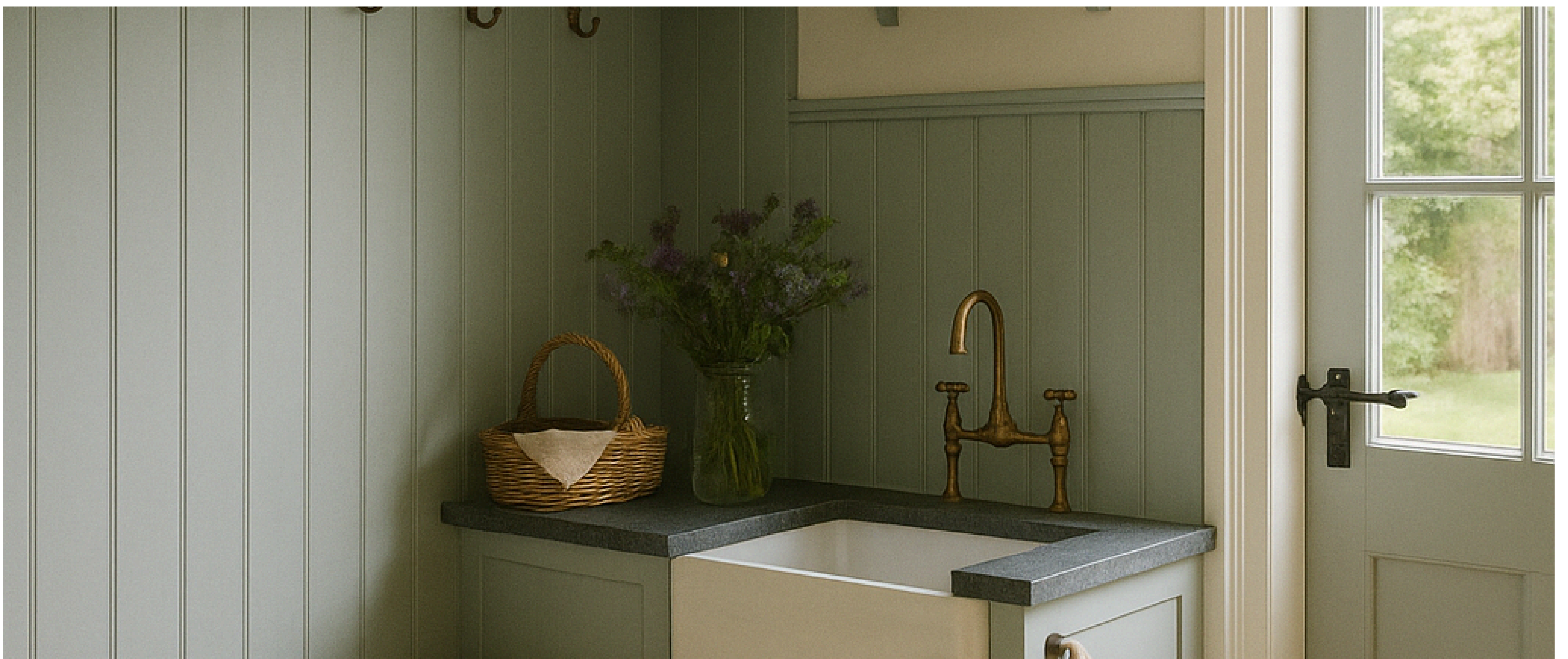
Micro-luxury kitchen with heritage colours