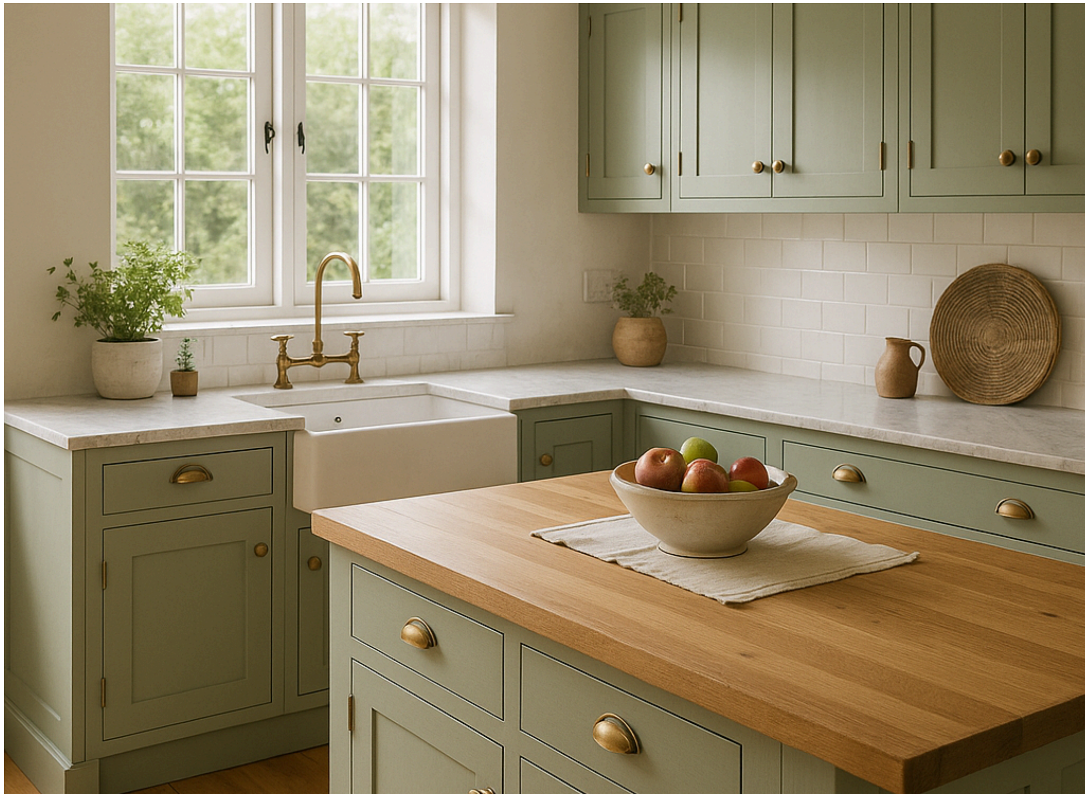
French Grey cabinetry with brass hardware